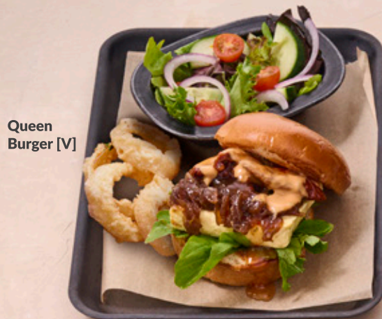
Queen Burger [V]