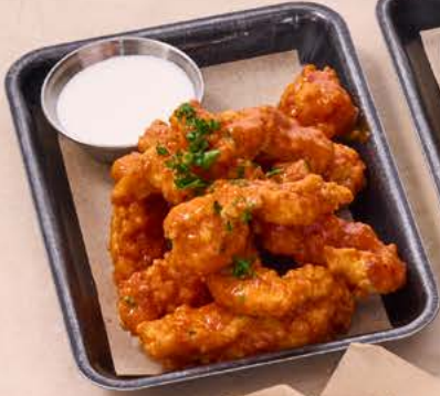
Crispy Chicken Tenders