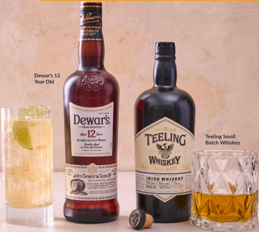
Dewar's 12 Year Old