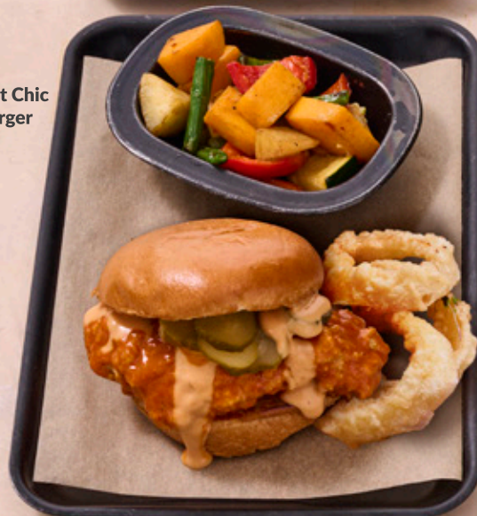
Hot Chic Burger