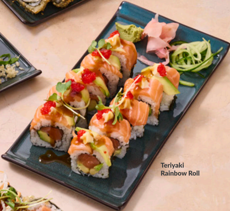
Teriyaki Rainbow Roll