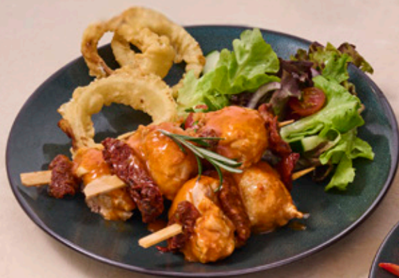
Peri-peri Chicken Skewers