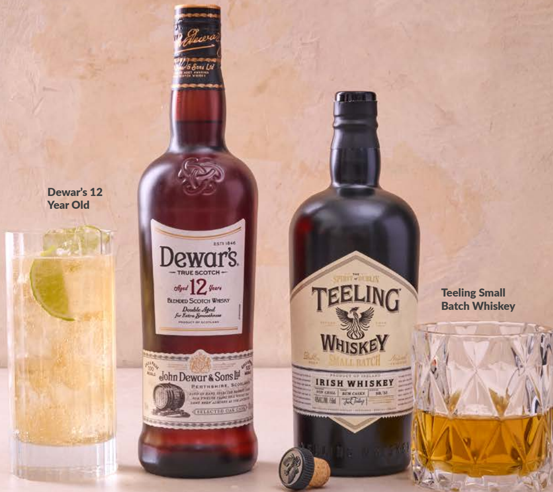
Dewar's 12 Year Old