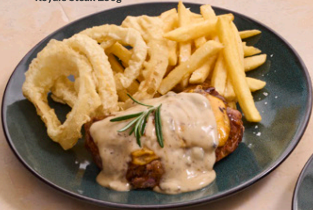
Royale Steak 250g