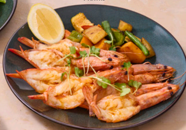
Lemon Butter Prawns