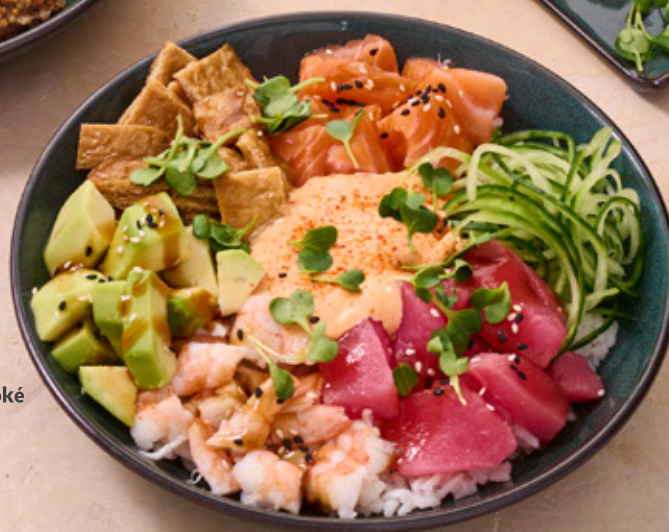
Happy Poké Bowl