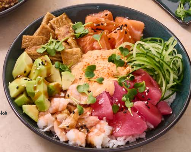
Happy Poké Bowl