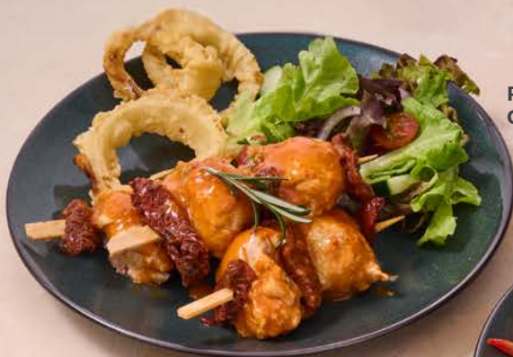
Peri-peri Chicken Skewers