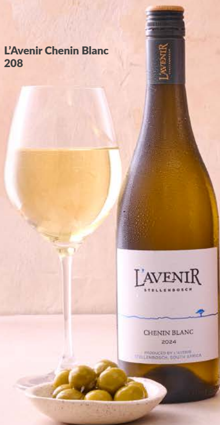
L'Avenir Chenin Blanc 208