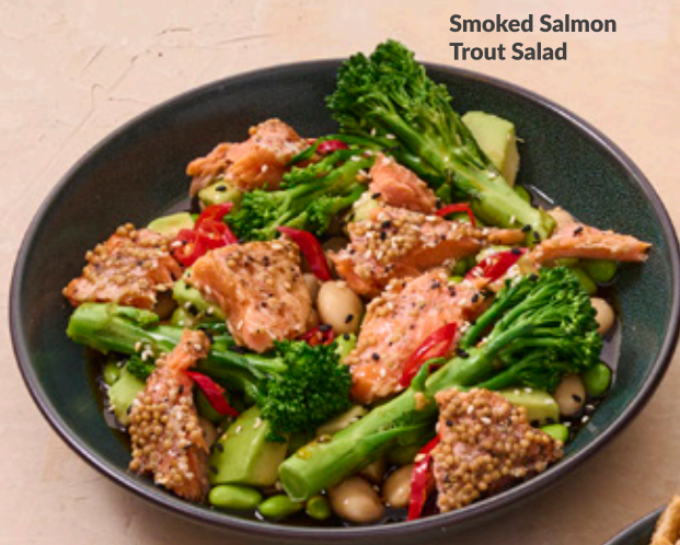
Smoked Salmon Trout Salad