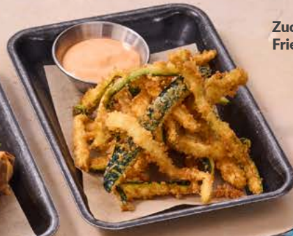
Zucchini Fries [V]