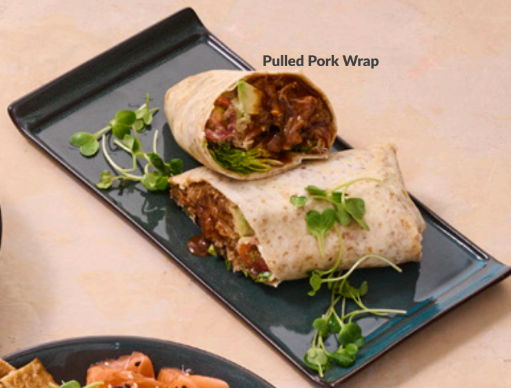
Pulled Pork Wrap