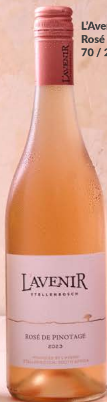
L'Avenir Horizon Rosé de Pinotage 70 / 210