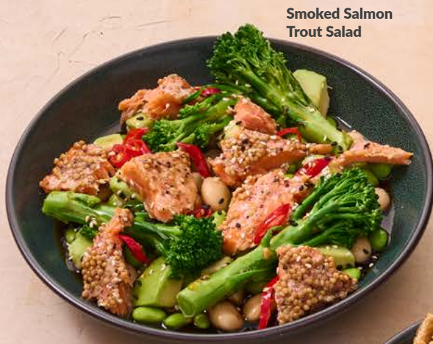
Smoked Salmon Trout Salad