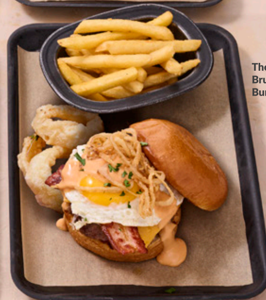
The Brunch Burger