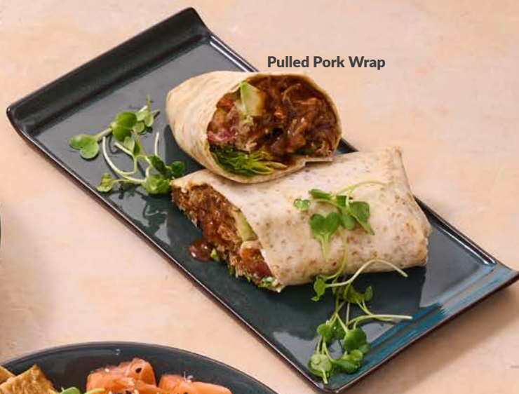
Pulled Pork Wrap