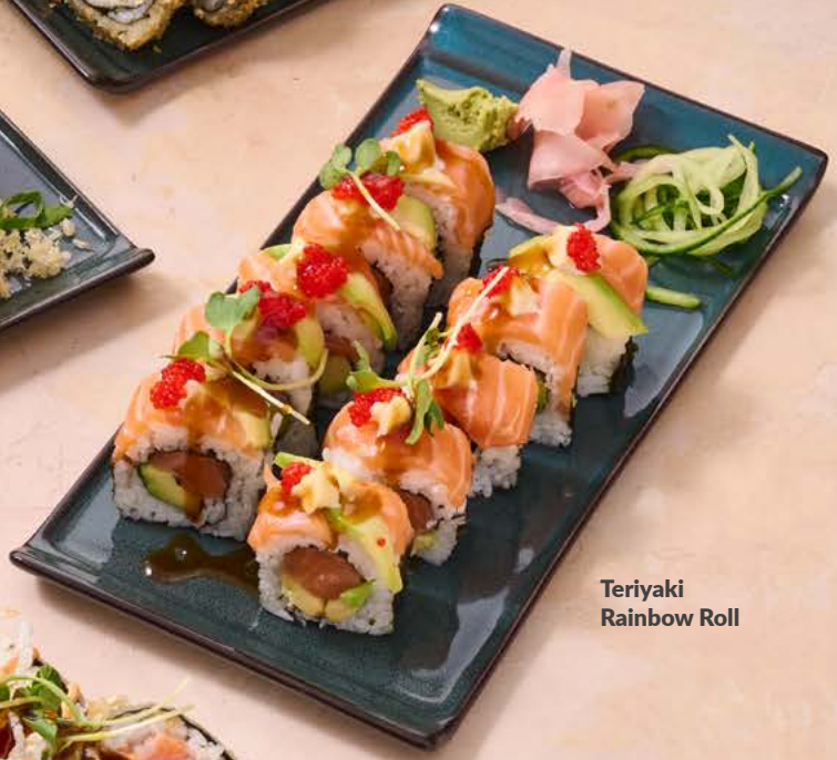
Teriyaki Rainbow Roll