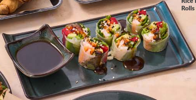
Rice Paper Rolls