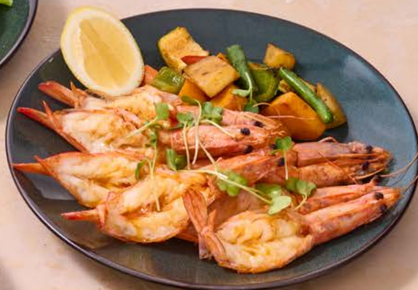
Lemon Butter Prawns