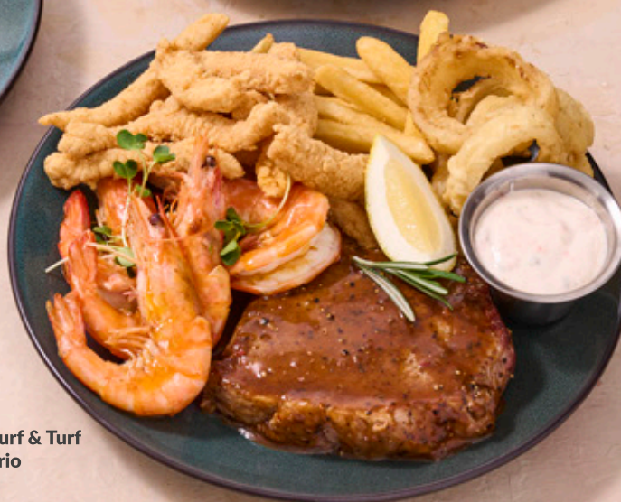
Surf & Turf Trio