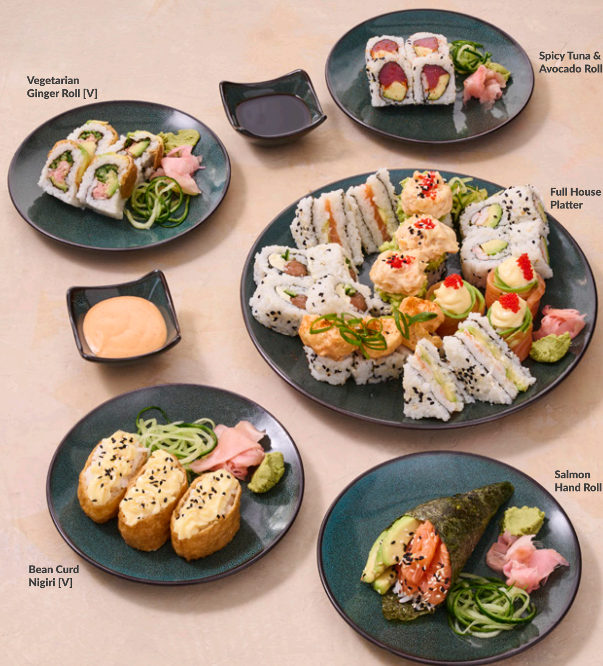
Vegetarian Ginger Roll [V]