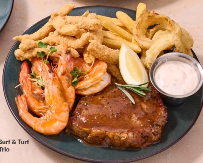
Surf & Turf Trio