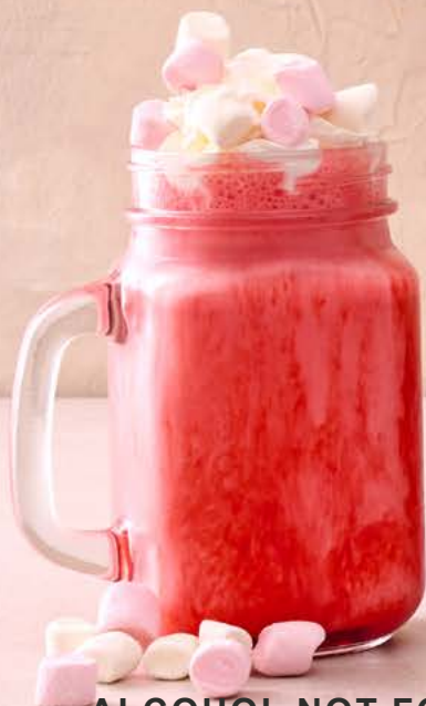
Strawberry & Marshmallow Milkshake