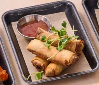
Pork Spring Rolls