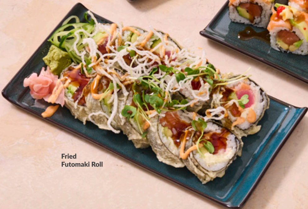
Fried Futomaki Roll