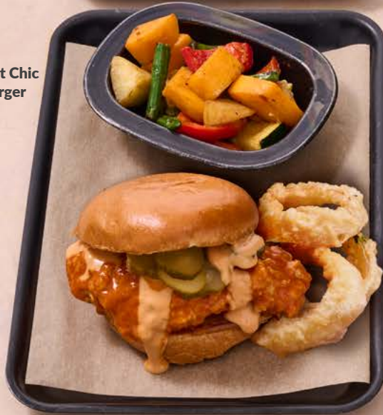
Hot Chic Burger