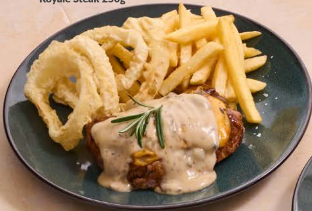
Royale Steak 250g