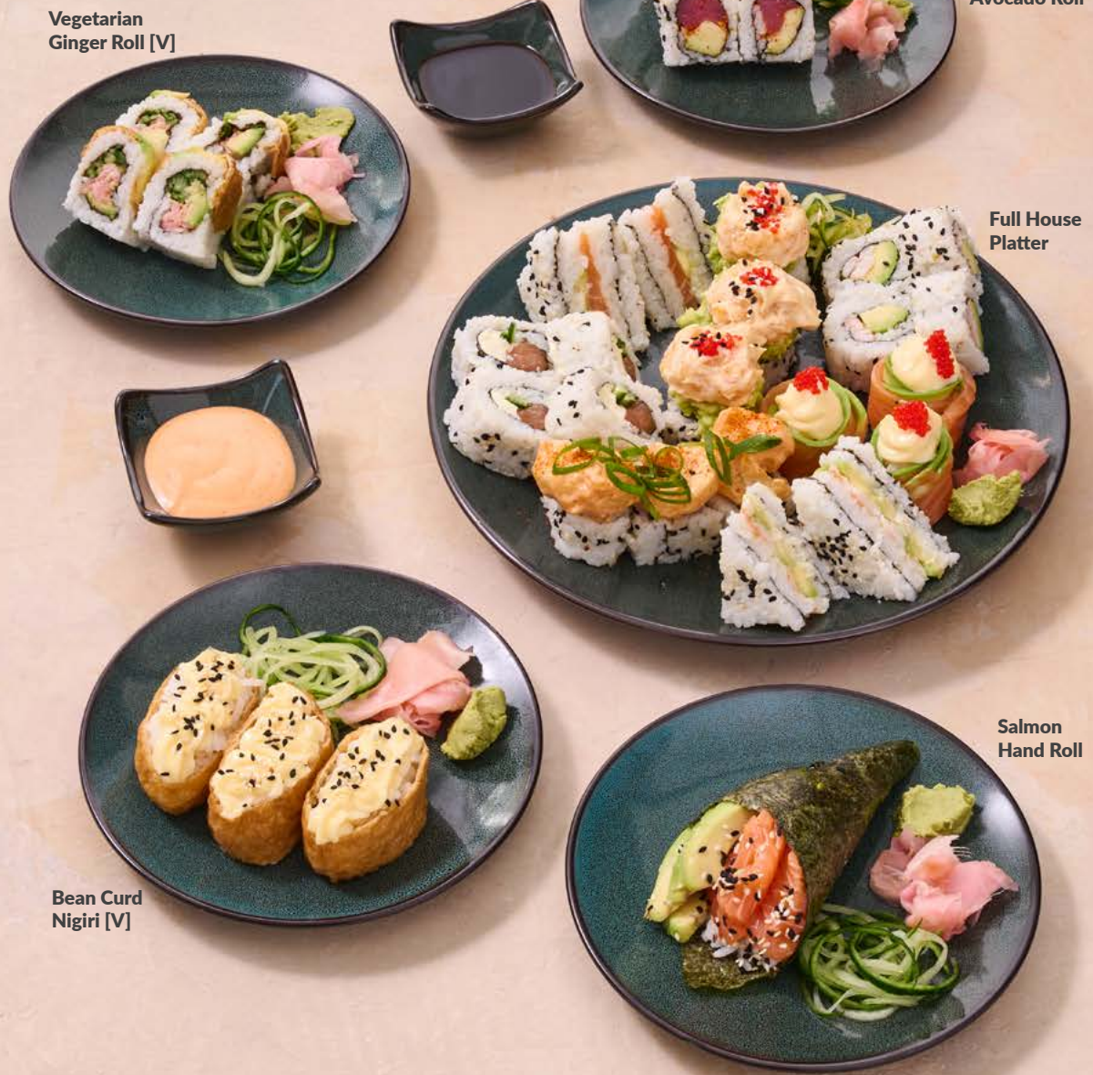
Vegetarian Ginger Roll [V]