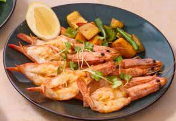
Lemon Butter Prawns