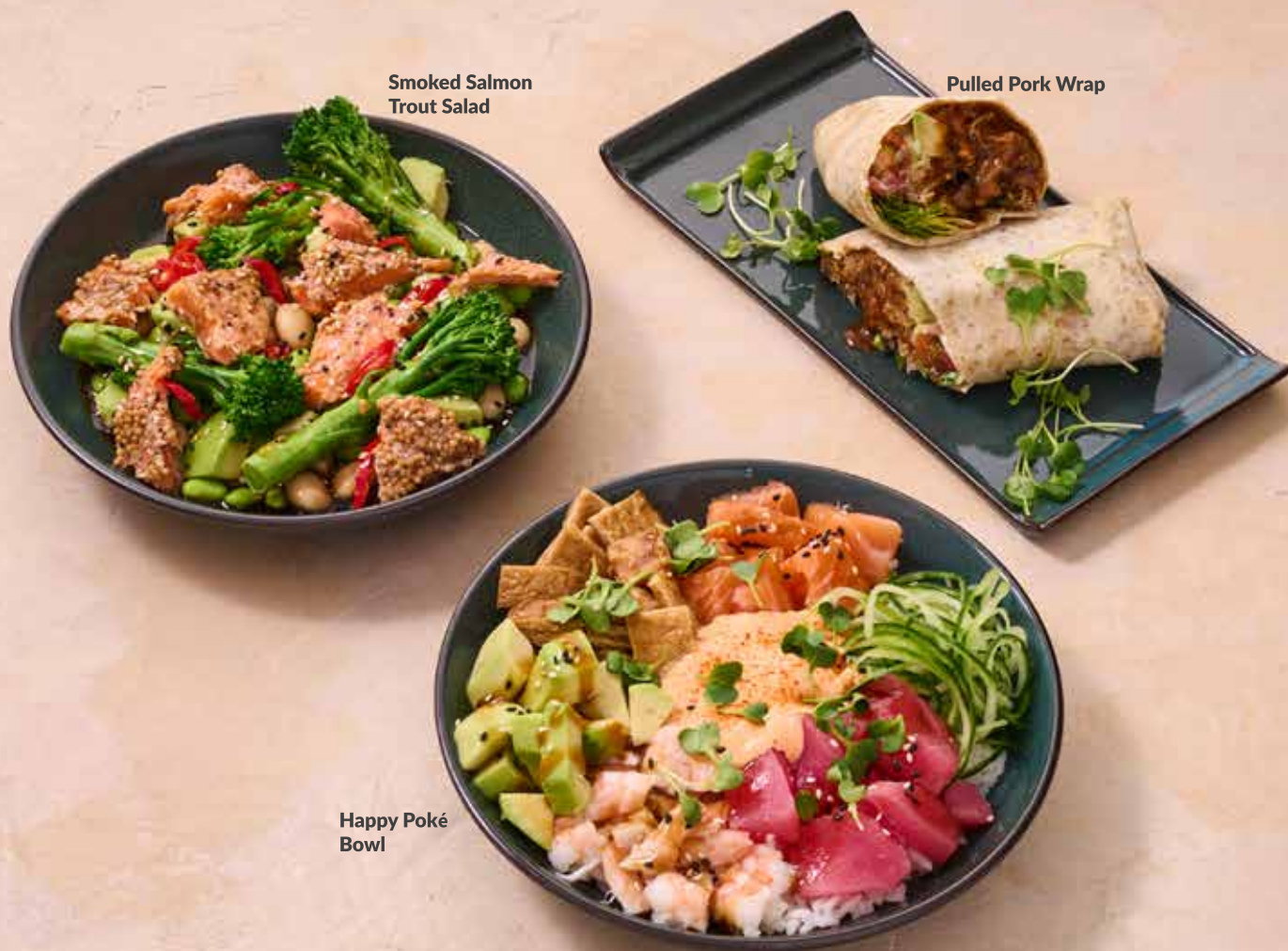
Smoked Salmon Trout Salad