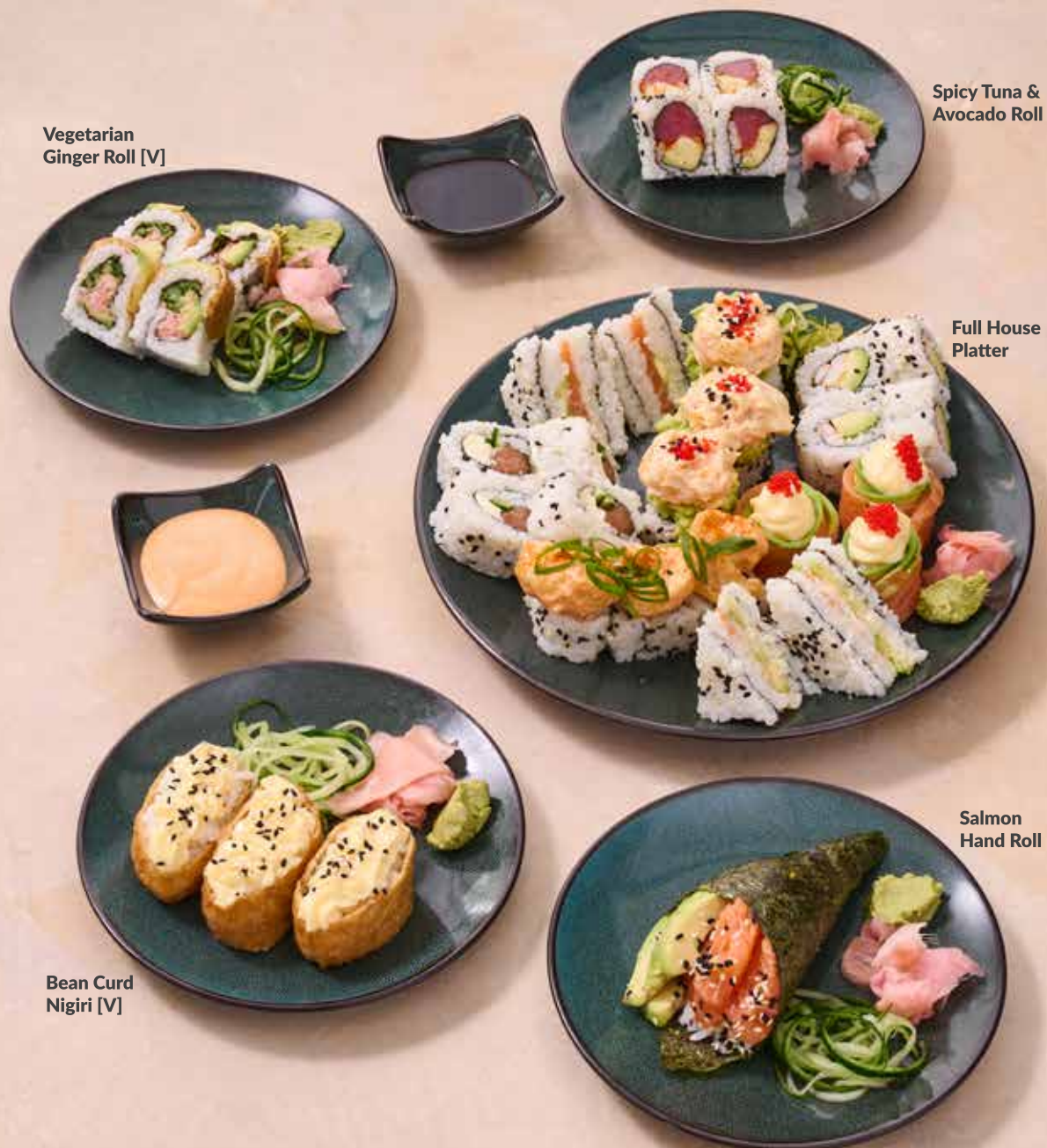
Vegetarian Ginger Roll [V]