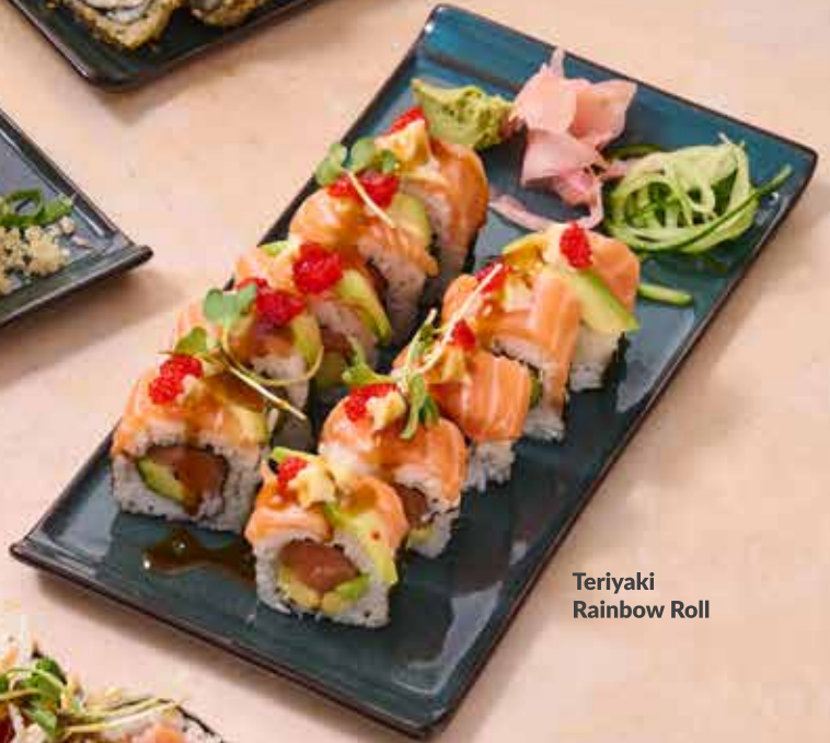
Teriyaki Rainbow Roll