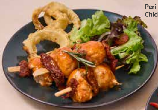
Peri-peri Chicken Skewers