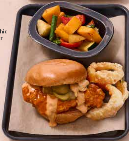
Hot Chic Burger