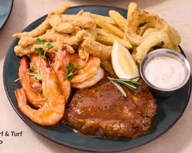
Surf & Turf Trio