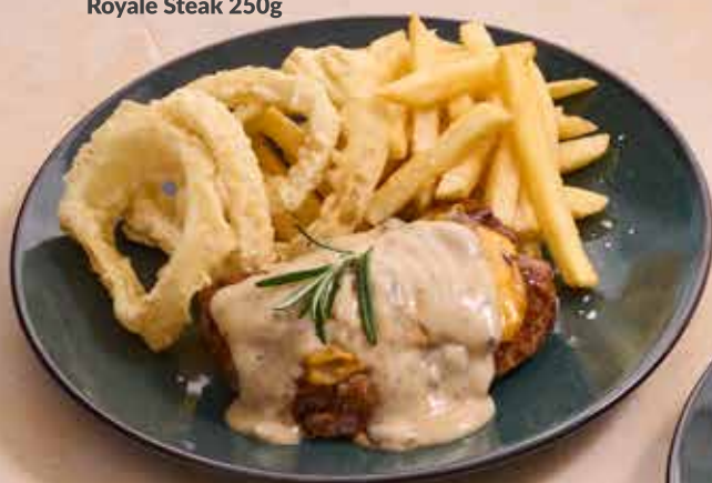
Royale Steak 250g