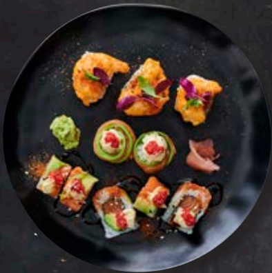
Walvis Bay 232 Salmon roses (2) Rock shrimp tempura rolls (3) Rainbow rolls reloaded (5)