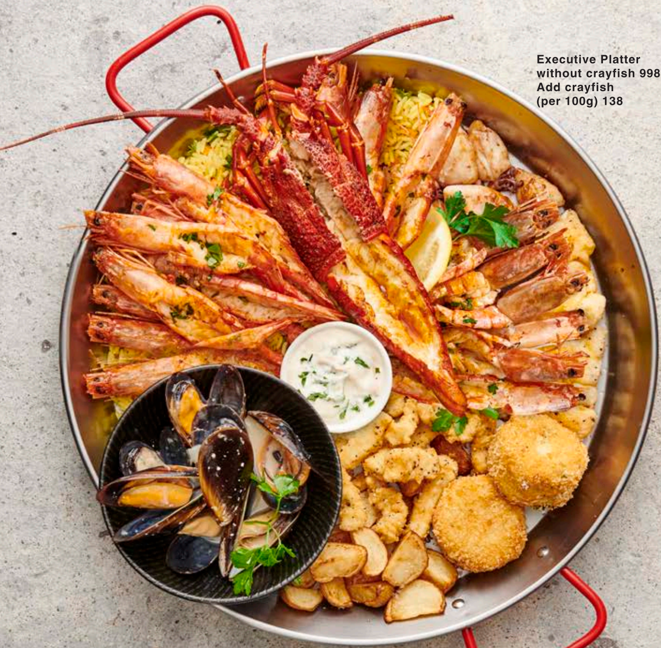
Executive Platter without crayfish 998 Add crayfish (per 100g) 138

Served with savoury rice and your choice of side