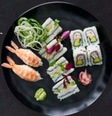
Prawn 226 Prawn nigiri (2) Prawn inside-out rolls (4) Prawn sandwiches (4)