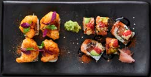
4 X 5 172 Rock shrimp tempura rolls (4) Rainbow rolls reloaded (5)