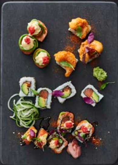
Deluxe 296 Salmon & avocado inside-out rolls (4) Salmon roses (3) Rainbow rolls reloaded (5) Rock shrimp tempura rolls (3)