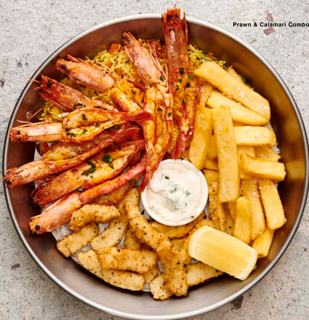
Prawn & Calamari Combo