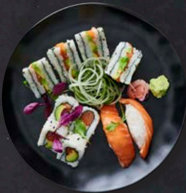
Salmon 232 Salmon nigiri (2) Salmon inside-out rolls (4) Salmon sandwiches (4)