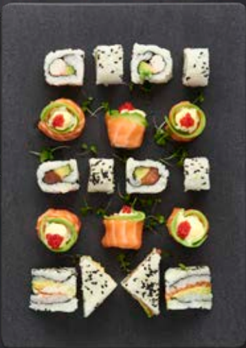
St Helena Bay 372 Salmon fashion sandwiches (2) Prawn fashion sandwiches (2) Salmon roses (6) Salmon & avocado inside-out rolls (4) California rolls (4)